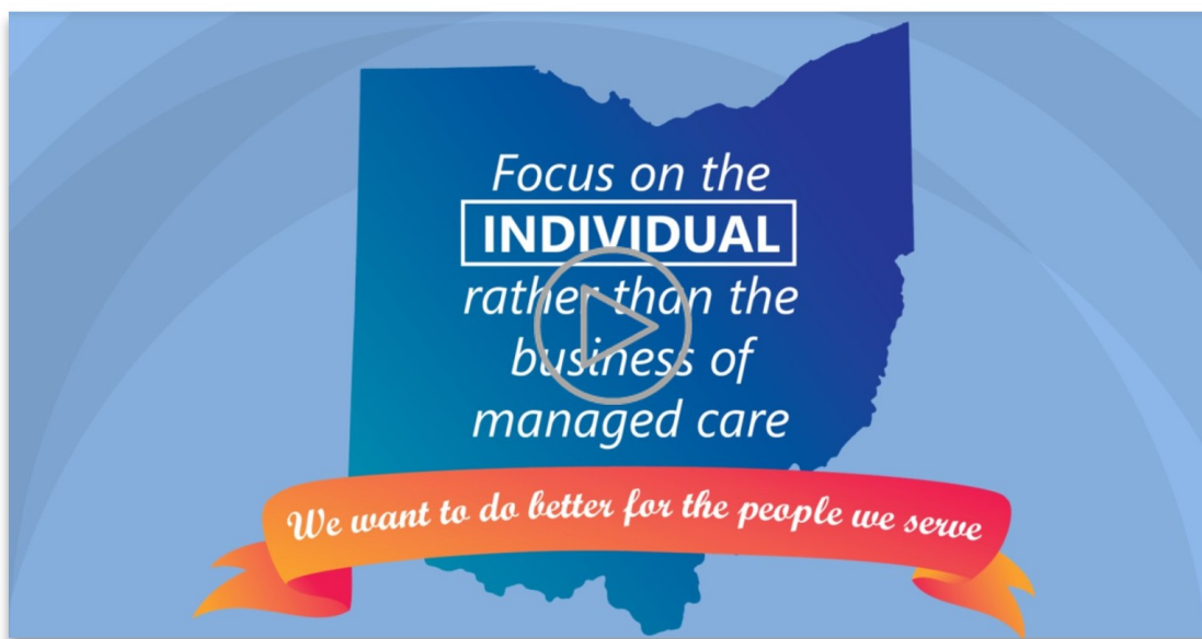
Video - Ohio Medicaid Reimagined: Putting the individual at the center of focus

The first video, " Putting the Individual at the Center of Focus ," describes how we are focusing on the individual rather than the business of managed care and outlines the five pillars of the reimagined Ohio Medicaid program. Click the image below to view the video.