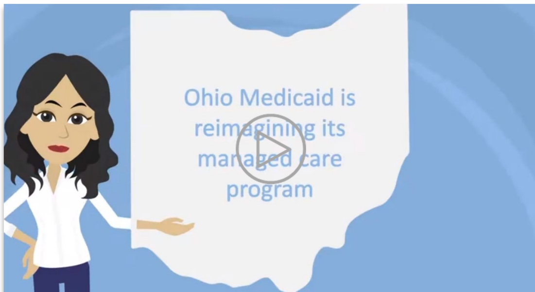
Video - Ohio Medicaid Reimagined: Supporting providers in better patient care

Health care providers are valued and important partners in serving Ohio Medicaid members. Click the image below to view a video that explains how the reimagined managed care program is supporting these providers in delivering better patient care.