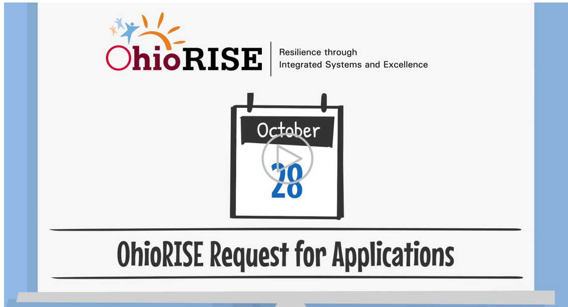
Video - The OhioRISE RFA is Now Open!

Our new video, " The OhioRISE RFA is Now Open! " highlights how Ohio Medicaid is improving care for its most vulnerable members.