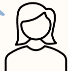
OhioRISE CME Staff Member

We are so excited to work with community partners to wrap care around children and youth. OhioRISE really aligns with who we are and how we operate within our communities. The people we've hired have fresh perspectives and are committed to serving the children and youth in our county.